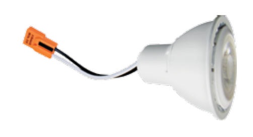
3" & 4" Housings