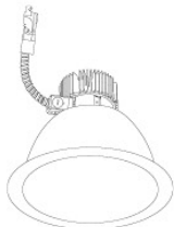
Reflector Trim E910L