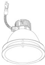
Drop Glass Trim E812L