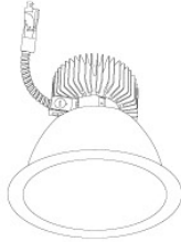
Reflector Trim E810L