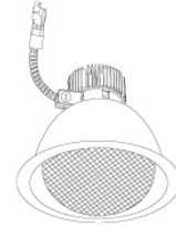
Wall Wash Trim E811L