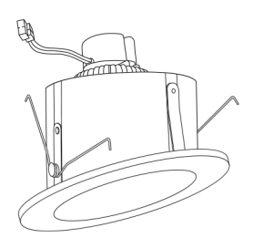
6" LED Sloped Insert Reflector Trim