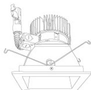
E440L Square Reflector Trim