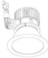
Round Reflector Trim E410L