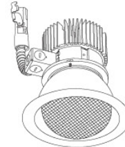
Round Wall Wash Trim E411L