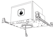
2-Hour Fire Rated 3" ICA Housing New Construction